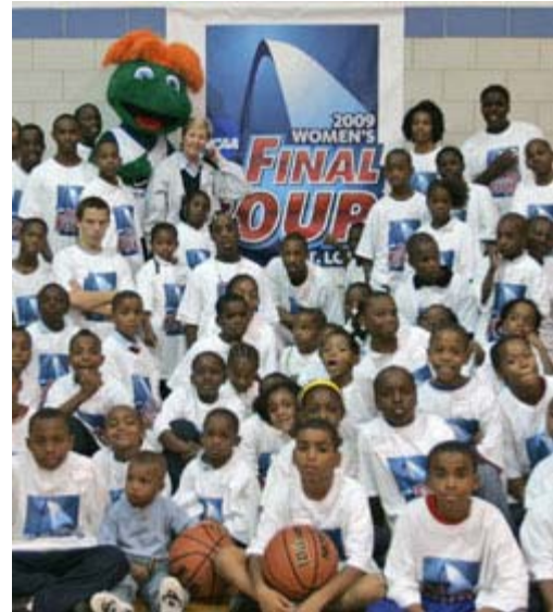
Participants from the Women's Final Four Tip-off Clinic pose in front of the event's 2009 logo, unveiled in October.

Companies and individuals interested in supporting the event through the purchase of suites and fundraising packages can call 314-421-0339.